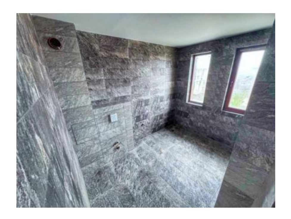
\textbf{Source URL:} \ \text{https://apartestate.com/en/catalog/villa-pomorie-pomorie-luxury-village-complex}