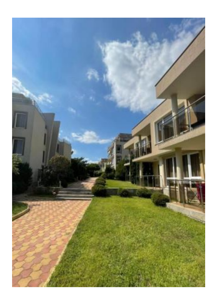
\textbf{Source URL:} \ \text{https://apartestate.com/en/catalog/two-storey-townhouse-st-vlas}