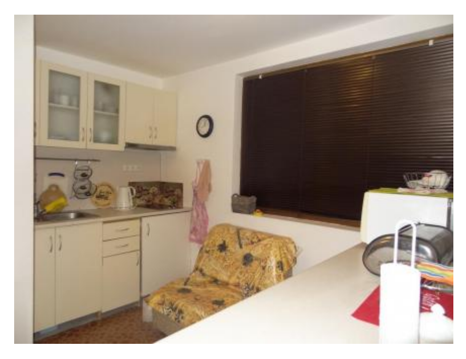
\textbf{Source URL:} \ \text{https://apartestate.com/en/catalog/two-storey-house-two-bedrooms-balchik}