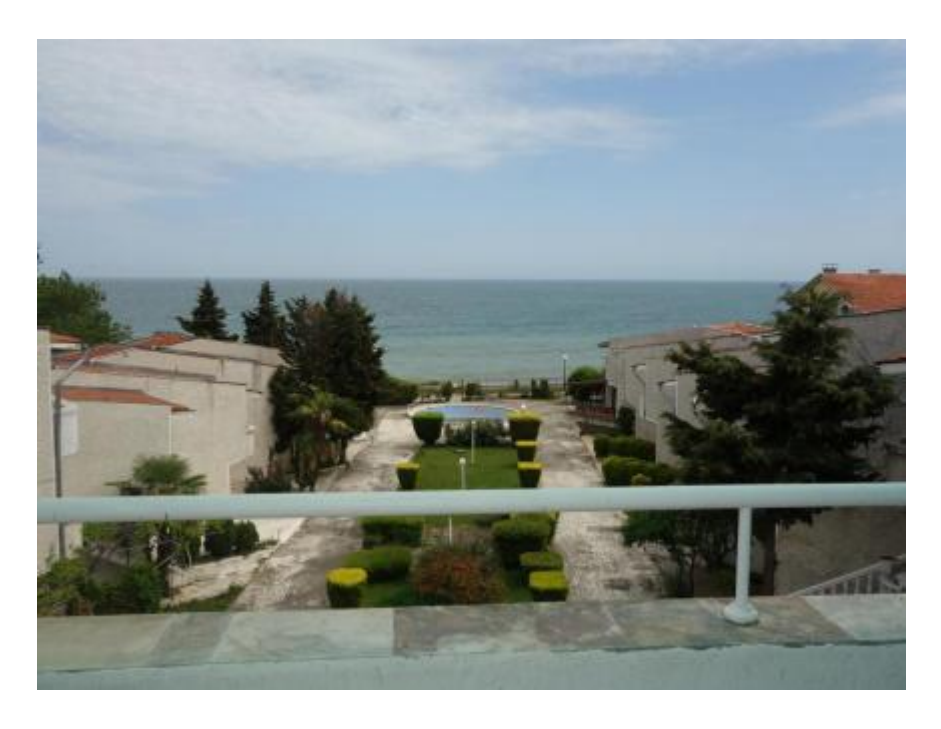
\textbf{Source URL:} \ \text{https://apartestate.com/en/catalog/two-bedroom-maisonette-sea-view-oasis-complex}