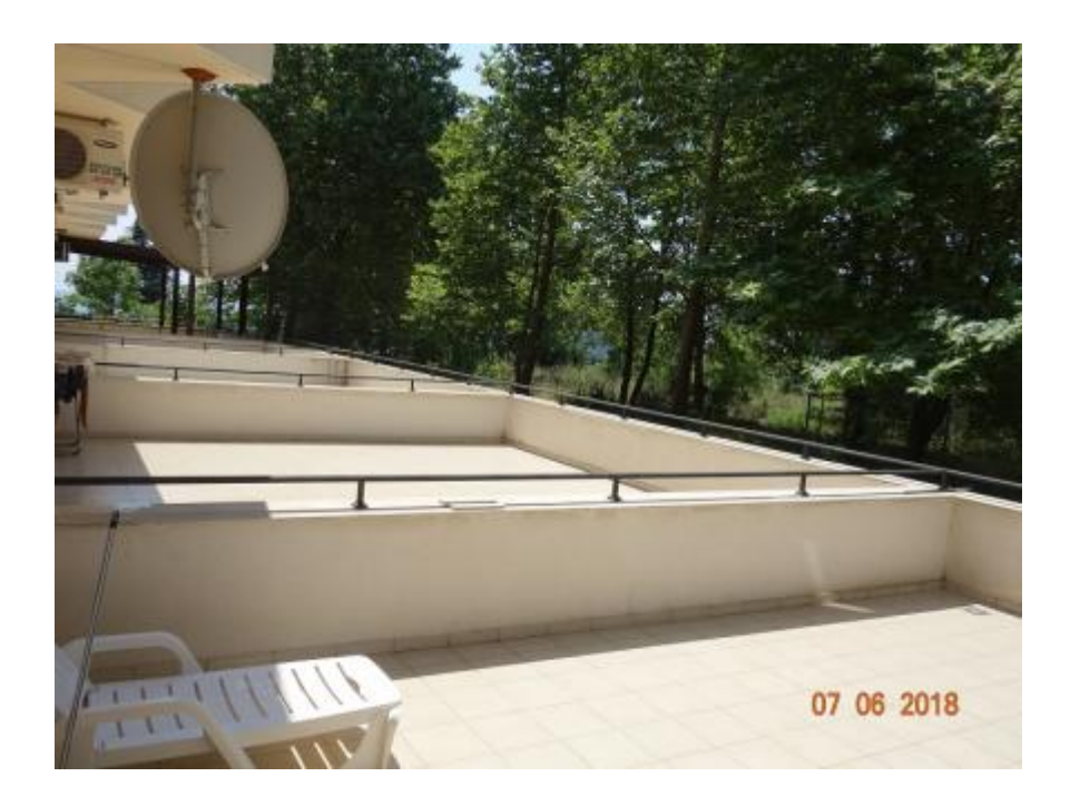
\textbf{Source URL:} \ \text{https://apartestate.com/en/catalog/two-bedroom-apartment-rich-2-complex-ravda}