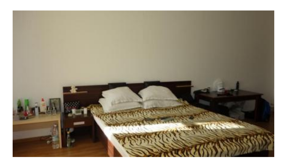
\textbf{Source URL:} \ https://apartestate.com/en/catalog/two-bedroom-apartment-living-complex-vigo-beach