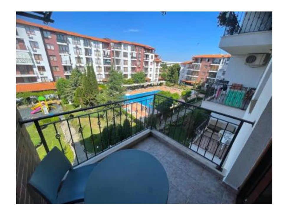
\textbf{Source URL:} \ \text{https://apartestate.com/en/catalog/two-bedroom-apartment-living-complex-apollon-7-rav} da