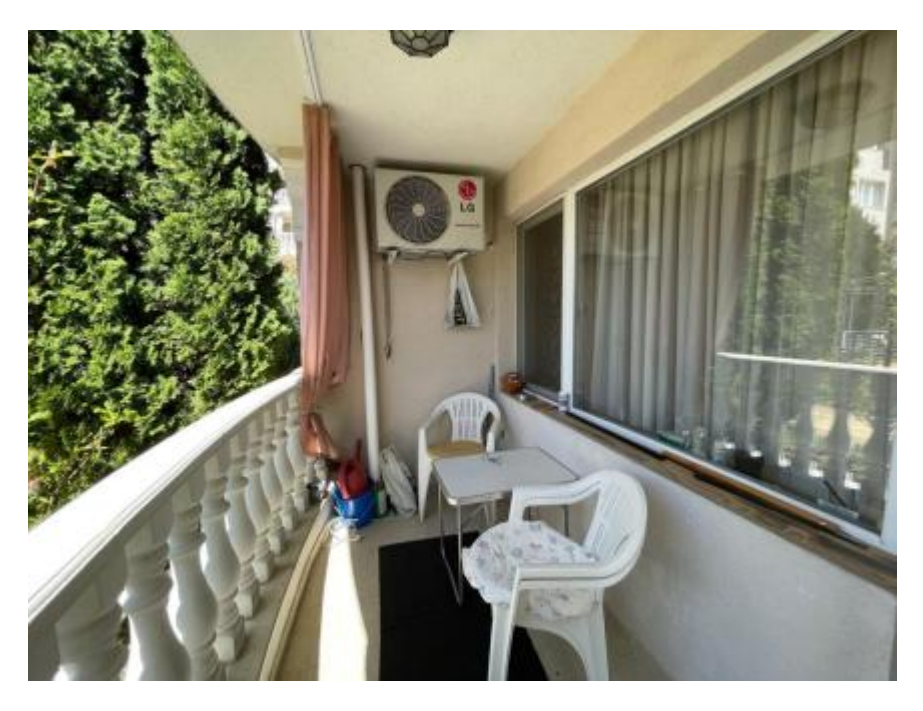
\textbf{Source URL:} \ \text{https://apartestate.com/en/catalog/three-bedroom-apartment-lifestyle-deluxe-complex}