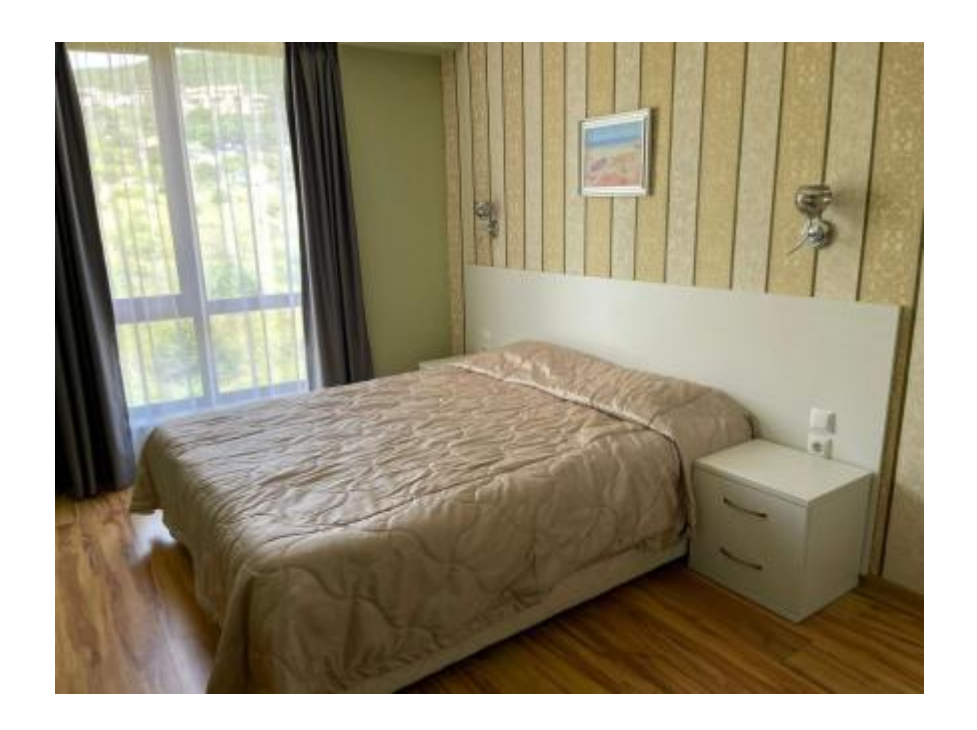
\textbf{Source URL:} \ \text{https://apartestate.com/en/catalog/sveti-vlas-spacious-one-bedroom-apartment}