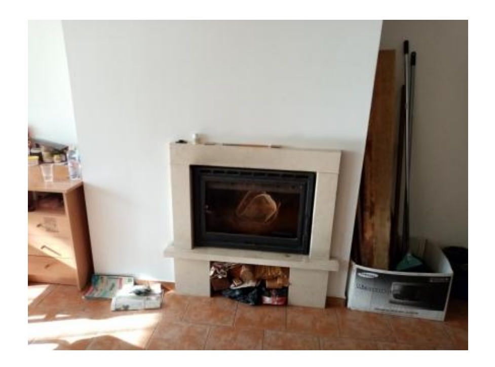
\textbf{Source URL:} \ \text{https://apartestate.com/en/catalog/sunny-apartment-two-bedrooms-ground-floor}