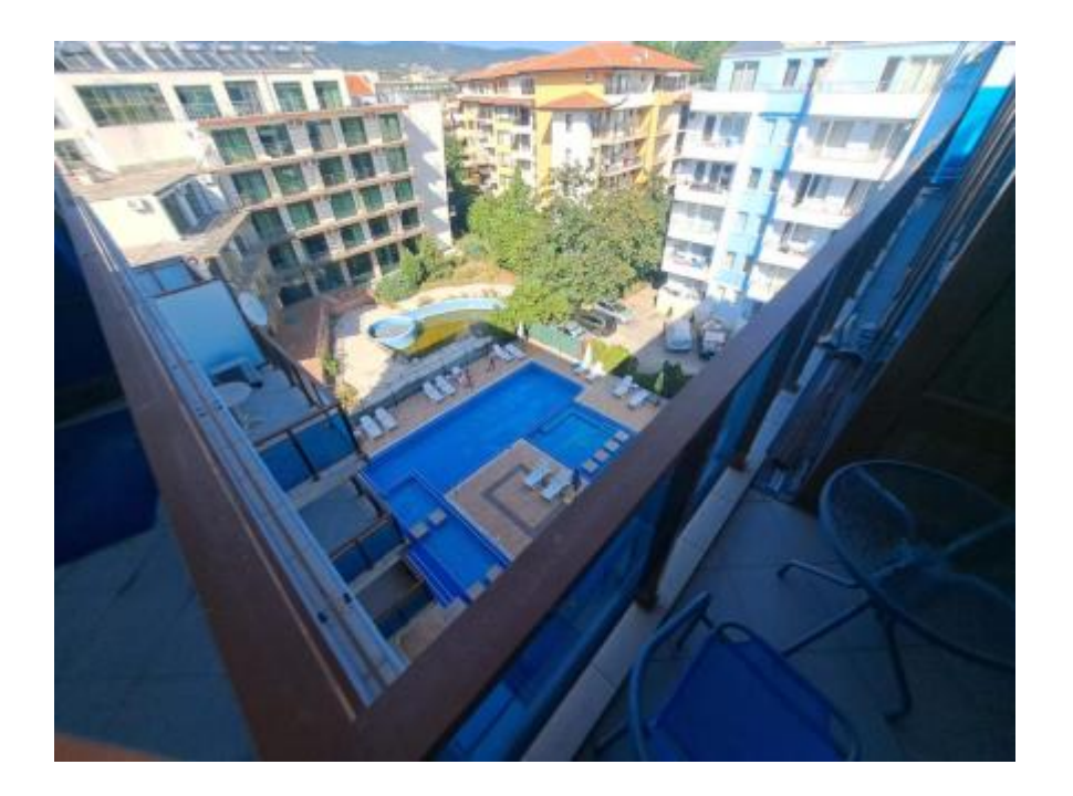
\textbf{Source URL:} \ \texttt{https://apartestate.com/en/catalog/studio-villa-itta-complex-sunny-beach}