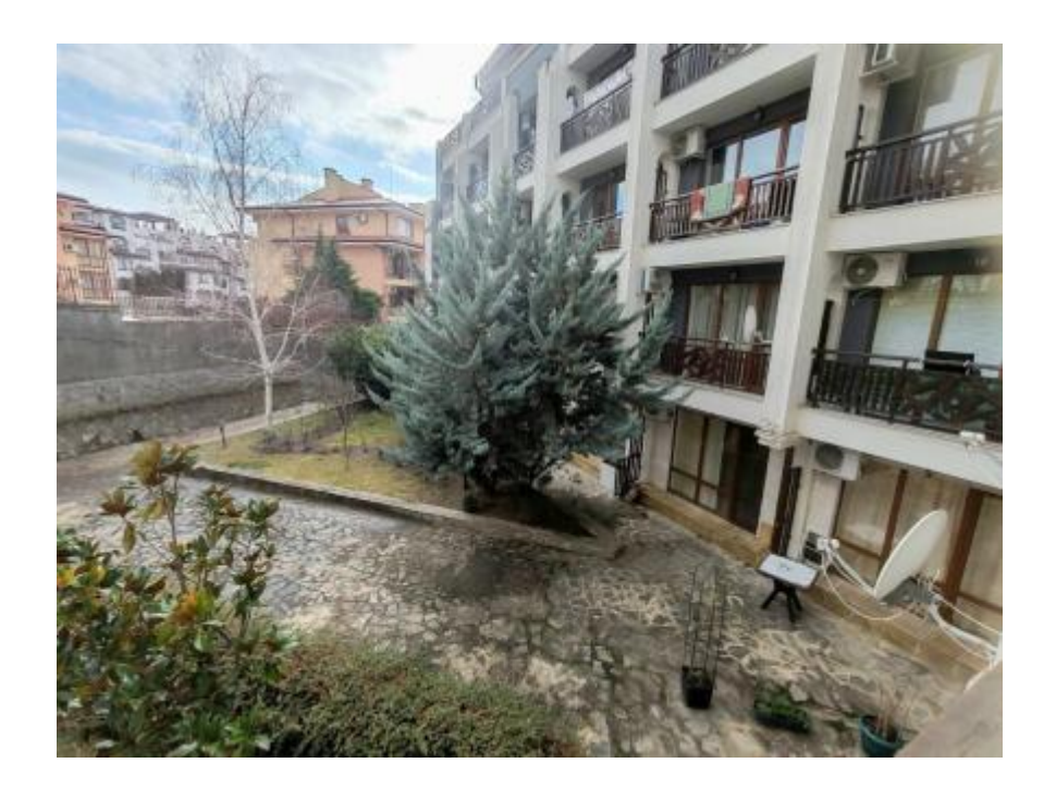
\textbf{Source URL:} \ \text{https://apartestate.com/en/catalog/studio-royal-palm-complex-saint-vlas}