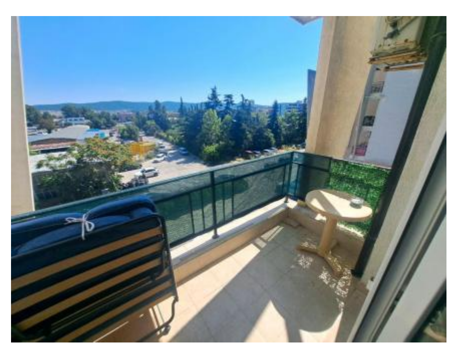
\textbf{Source URL:} \ \texttt{https://apartestate.com/en/catalog/studio-grand-camelia-complex-sunny-beach}