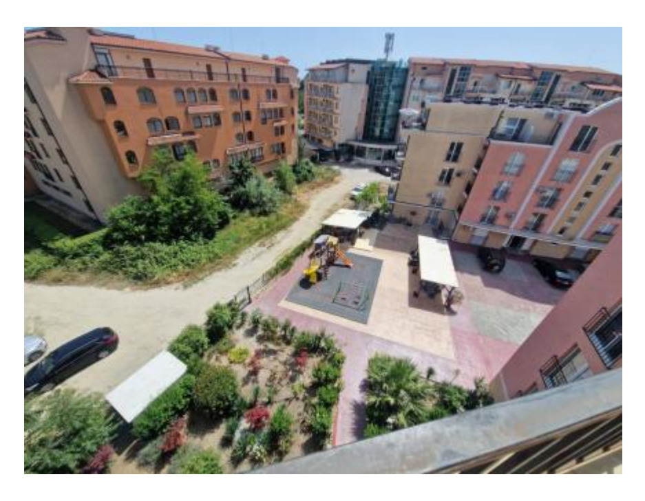
\textbf{Source URL:} \ \text{https://apartestate.com/en/catalog/studio-golden-day-complex-sunny-beach}