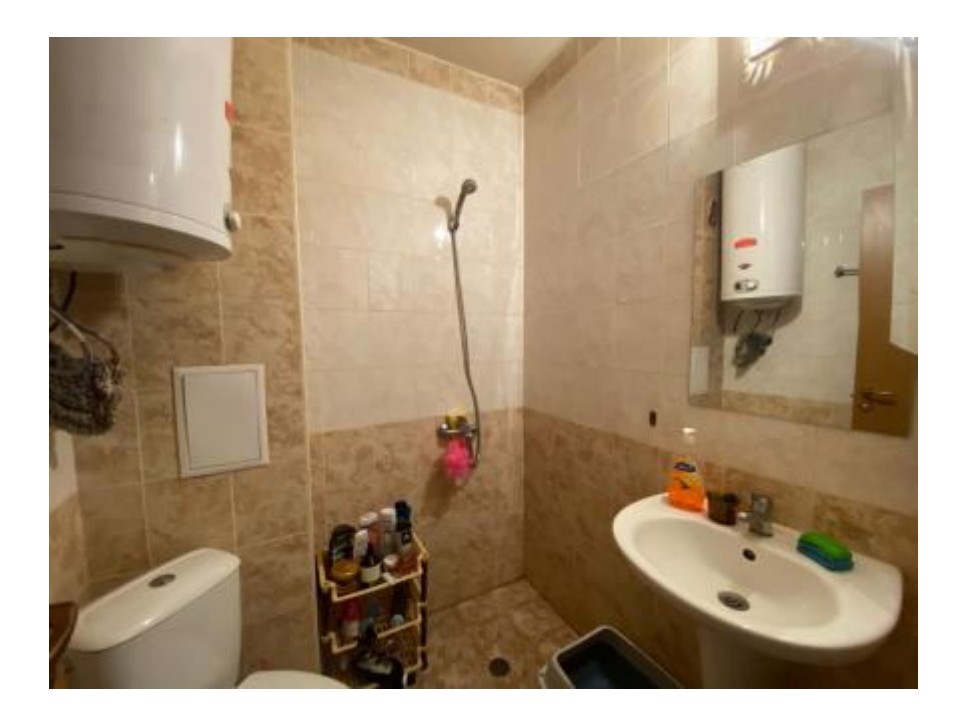
\textbf{Source URL:} \ \text{https://apartestate.com/en/catalog/studio-apartment-sunny-day-3-sunny-beach}