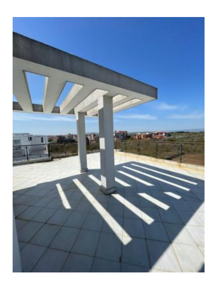
\textbf{Source URL:} \ \text{https://apartestate.com/en/catalog/studio-apartment-nessebar-large-terrace}