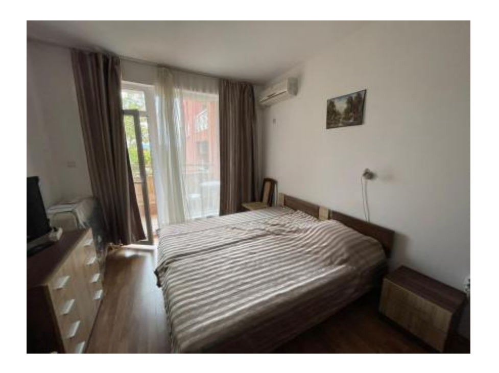
\textbf{Source URL:} \ \text{https://apartestate.com/en/catalog/studio-apartment-investment-sunny-beach}