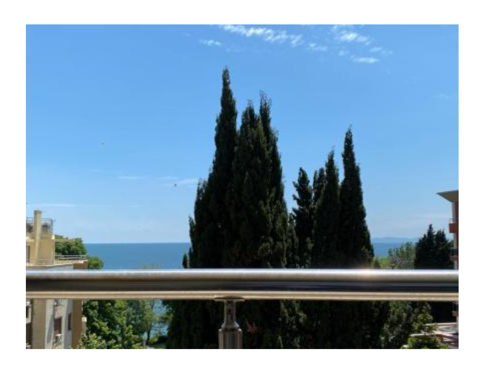
\textbf{Source URL:} \ \texttt{https://apartestate.com/en/catalog/spacious-studio-sea-view-nessebar}