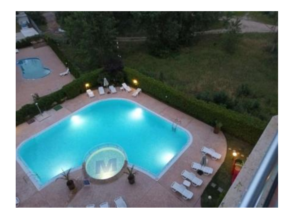
\textbf{Source URL:} \ \text{https://apartestate.com/en/catalog/spacious-apartment-marack-2-complex-sunny-beach}