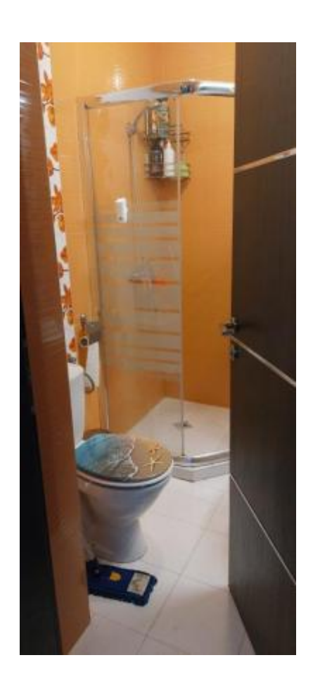
\textbf{Source URL:} \ \text{https://apartestate.com/en/catalog/sea-real-estate-nessebar-one-bedroom-apartment}