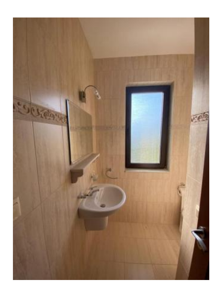
\textbf{Source URL:} \ \text{https://apartestate.com/en/catalog/sales-large-stylish-cottage-pomorie}