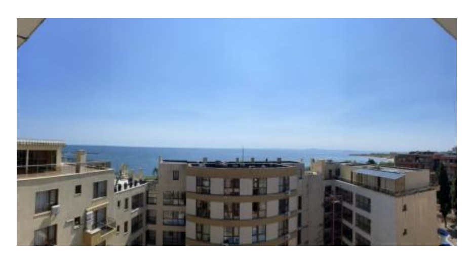
\textbf{Source URL:} \ \texttt{https://apartestate.com/en/catalog/sales-large-apartment-nessebar}