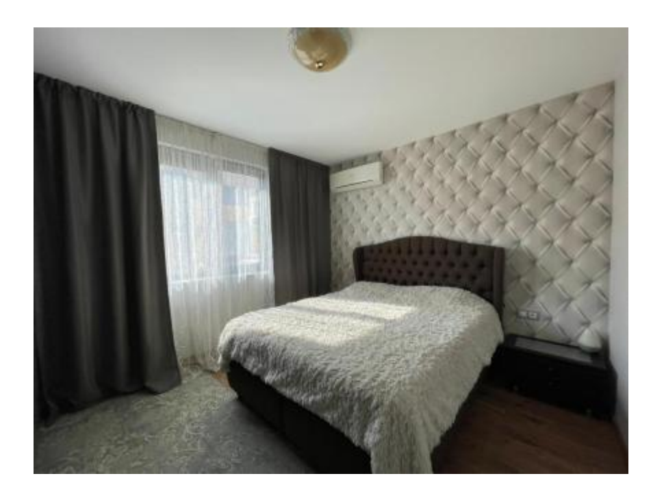
\textbf{Source URL:} \ \text{https://apartestate.com/en/catalog/sales-apartment-two-bedrooms-sarafovo}