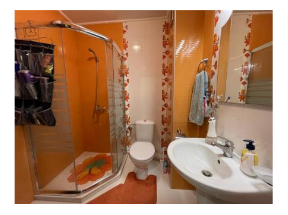
\textbf{Source URL:} \ \text{https://apartestate.com/en/catalog/sales-apartment-one-bedroom-nessebar-} 250-m-sea