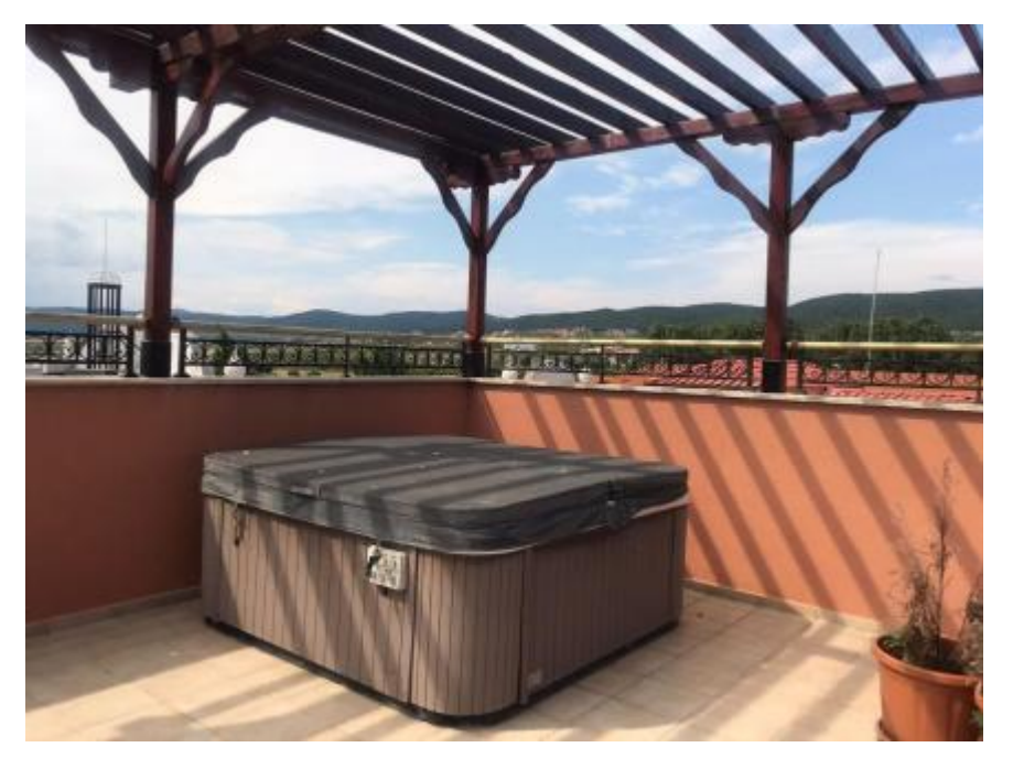
\textbf{Source URL:} \ \text{https://apartestate.com/en/catalog/penthouse-elite-harmony-suites-complex-sunny-beach}