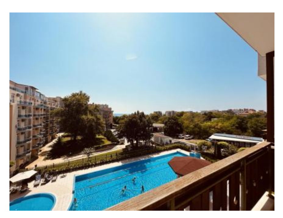
\textbf{Source URL:} \ \text{https://apartestate.com/en/catalog/one-bedroom-apartment-ravda-near-beach}