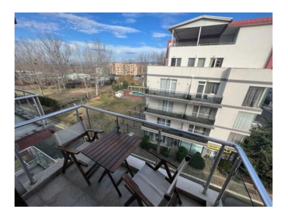
\textbf{Source URL:} \ \text{https://apartestate.com/en/catalog/one-bedroom-apartment-living-complex-tars} is