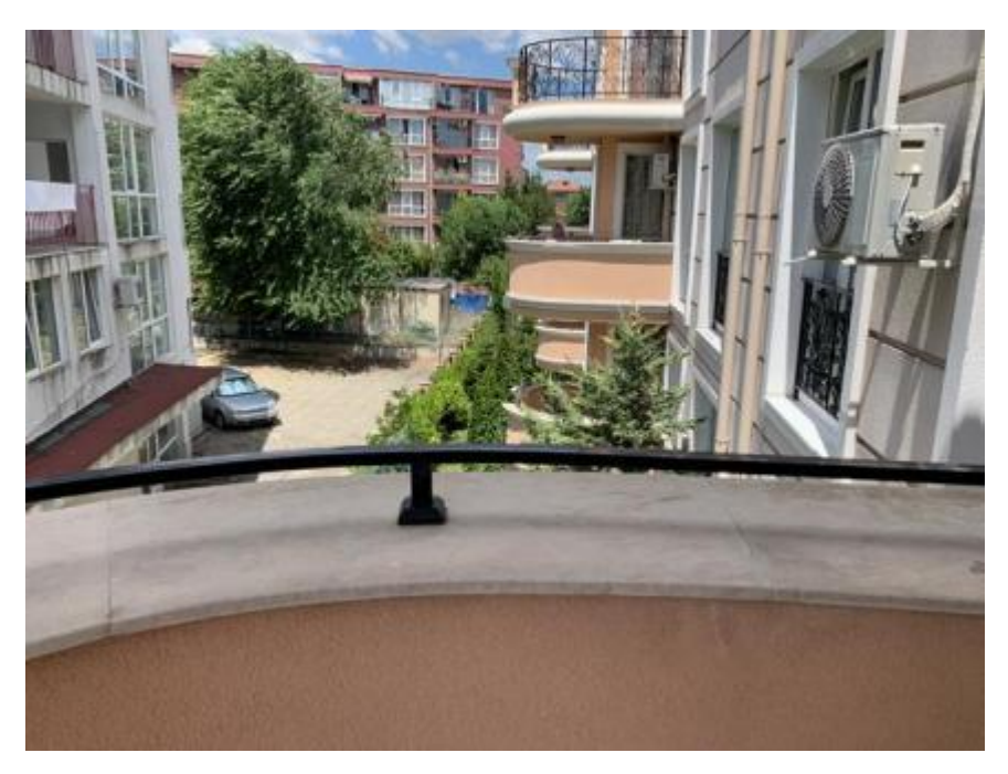
\textbf{Source URL:} \ \text{https://apartestate.com/en/catalog/one-bedroom-apartment-complex-mellia-8-rav} da