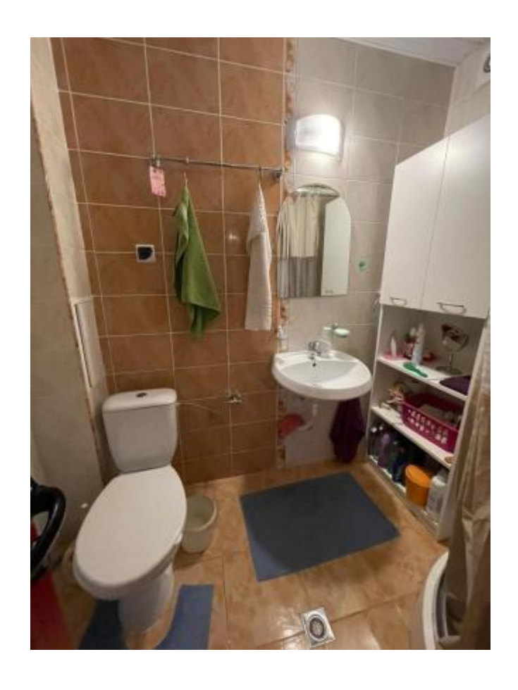
\textbf{Source URL:} \ \text{https://apartestate.com/en/catalog/large-apartment-sunny-beach-marack-apartments}