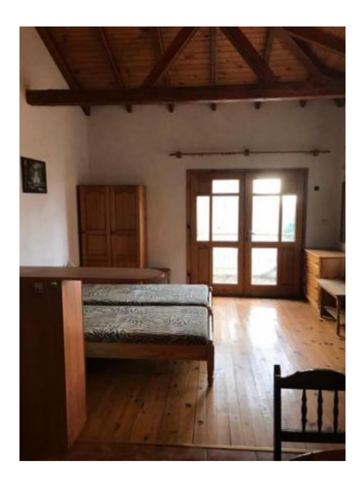
\textbf{Source URL:} \ \text{https://apartestate.com/en/catalog/house-village-kosharitsa-sale}