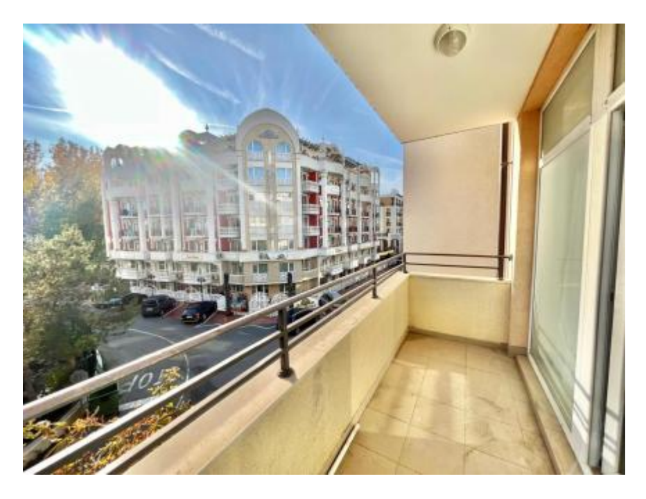
\textbf{Source URL:} \ \text{https://apartestate.com/en/catalog/cozy-furnished-apartment-grand-camelia-complex}