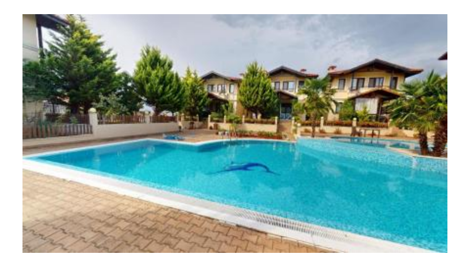
\textbf{Source URL:} \ \text{https://apartestate.com/en/catalog/cottage-living-complex-saint-george-kosharits} \\