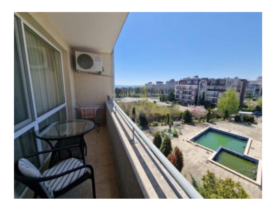
\textbf{Source URL:} \ \texttt{https://apartestate.com/en/catalog/apartment-sveti-vlas-butterfly-complex}