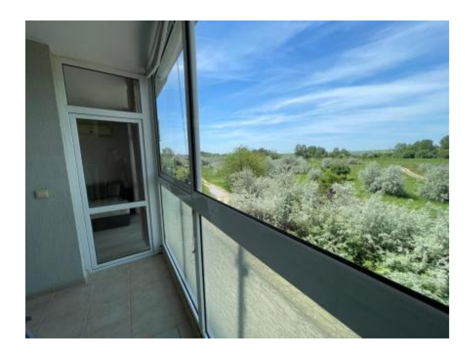
\textbf{Source URL:} \ \texttt{https://apartestate.com/en/catalog/apartment-sun-city-complex-sunny-beach}