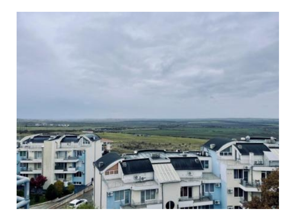
\textbf{Source URL:} \ \text{https://apartestate.com/en/catalog/apartment-spacious-terrace-sunset-kosharitsa-complex}