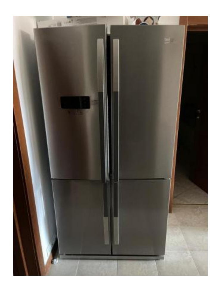
\textbf{Source URL:} \ \text{https://apartestate.com/en/catalog/apartment-sale-first-sea-line-sveti-vlas}