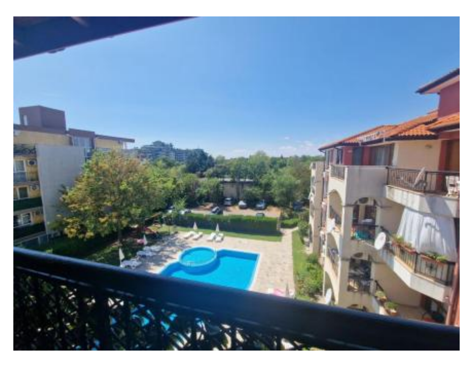
\textbf{Source URL:} \ \texttt{https://apartestate.com/en/catalog/apartment-ravda-ravda-dom-complex}