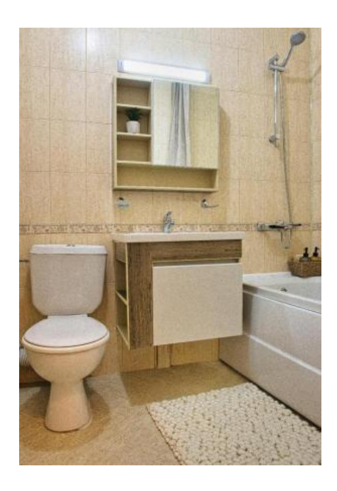
\textbf{Source URL:} \ \text{https://apartestate.com/en/catalog/apartment-barco-del-sol-complex-sunny-beach}