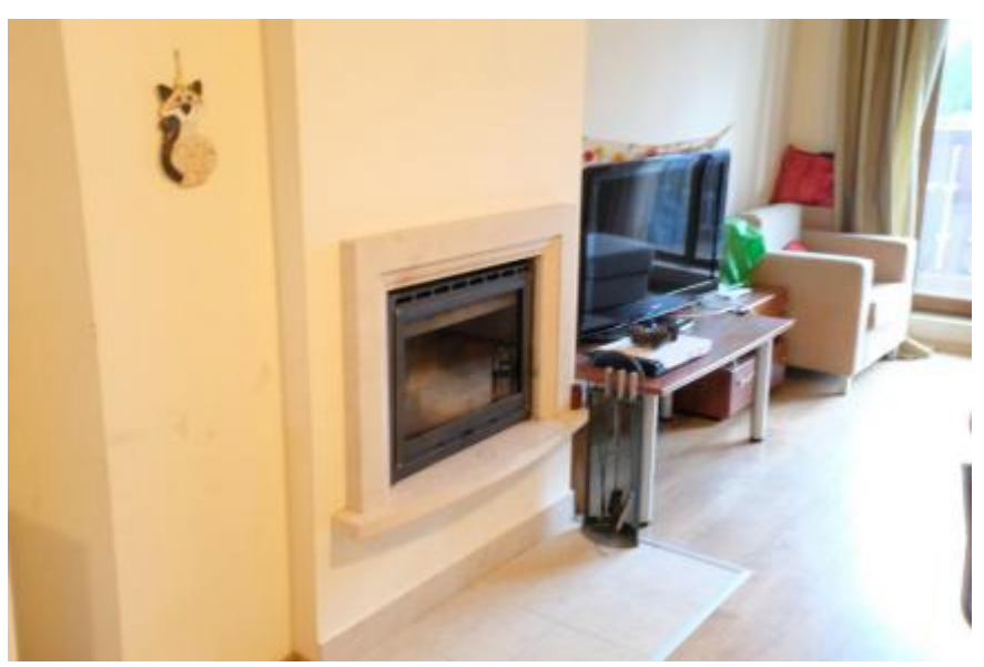
\textbf{Source URL:} \ \text{https://apartestate.com/en/catalog/2-bedroom-apartment-bansko-near-ski-area}